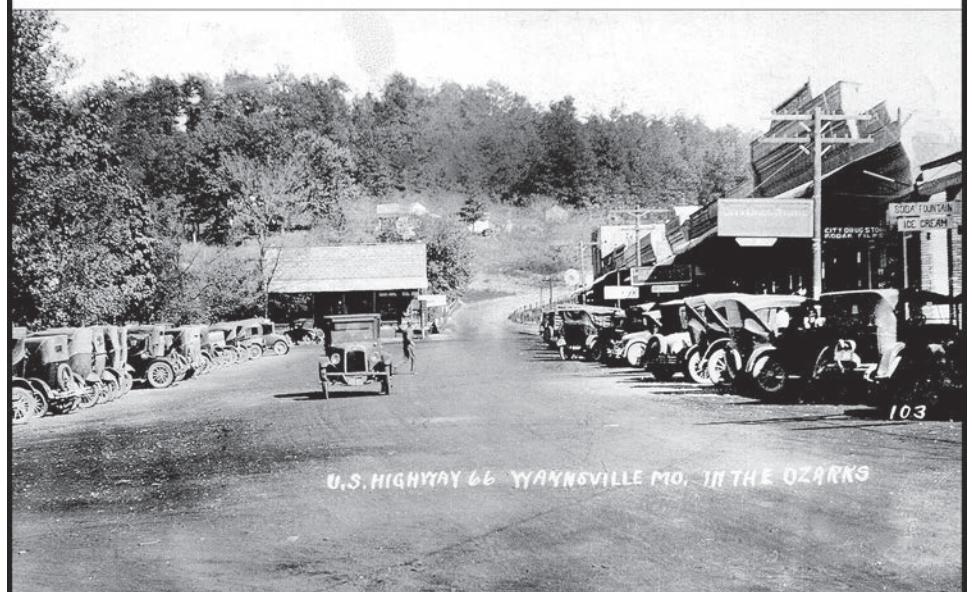
Gravel-surfaced Route 66 through Waynesville in 1929 before it was paved in 1930.